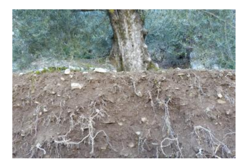
Addresse El Cornetal, Torres, Jaén