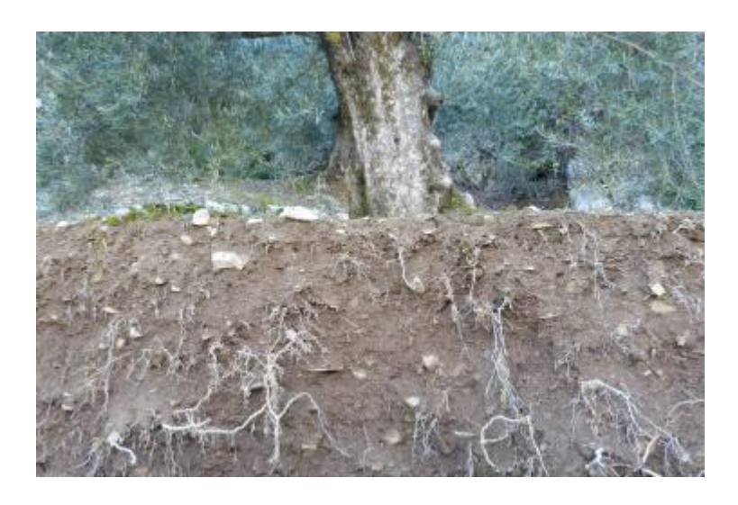
Address El Cornetal, Torres, Jaén