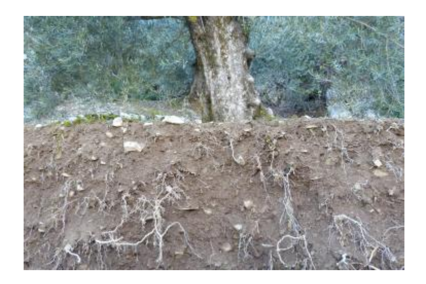
Address El Cornetal, Torres, Jaén