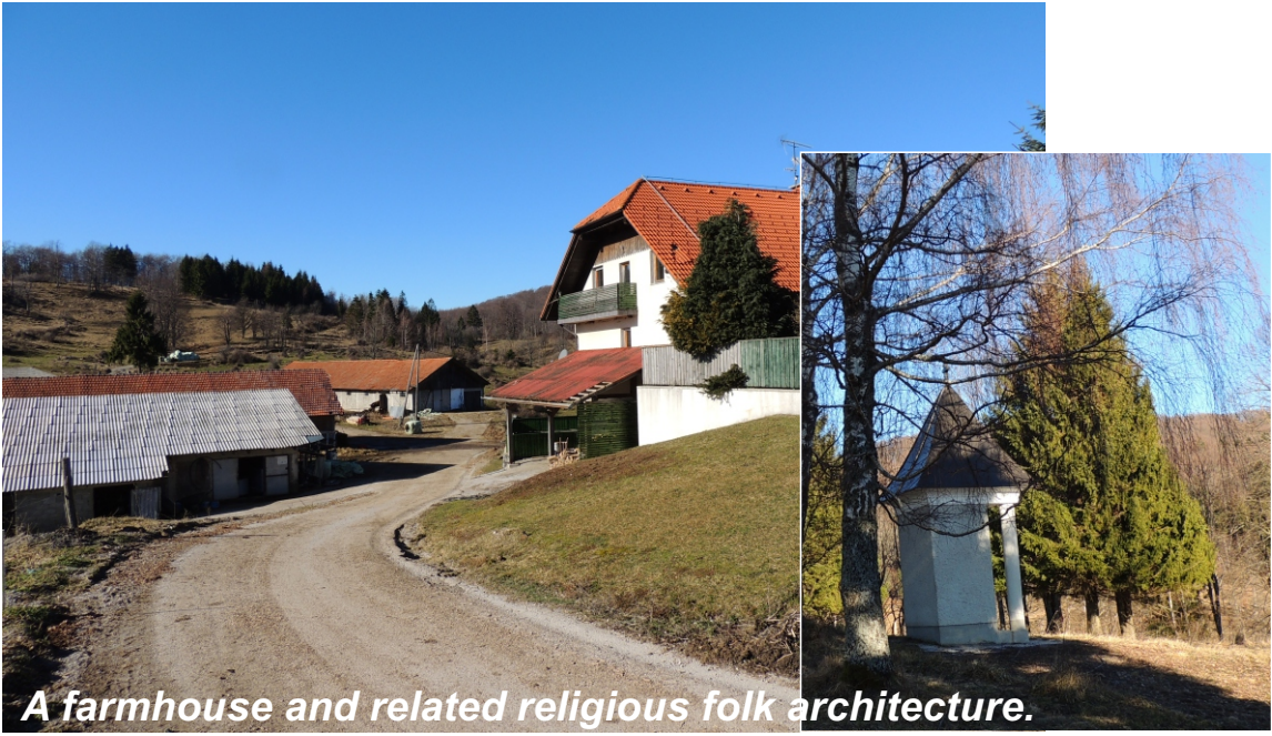
A farmhouse and related religious folk architecture.