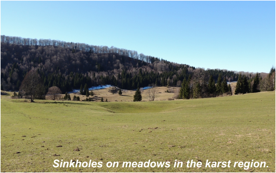
Sinkholes on meadows in the karst region.