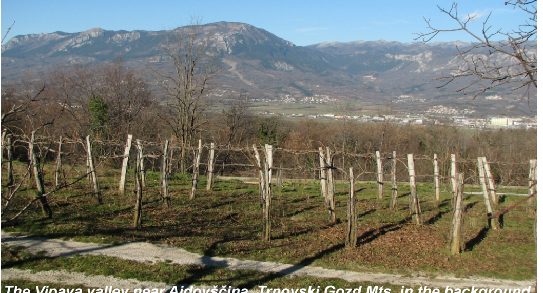
The Vipava valley near Ajdovščina. Trnovski Gozd Mts. in the background.